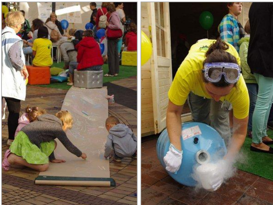
Lithuania, 2012